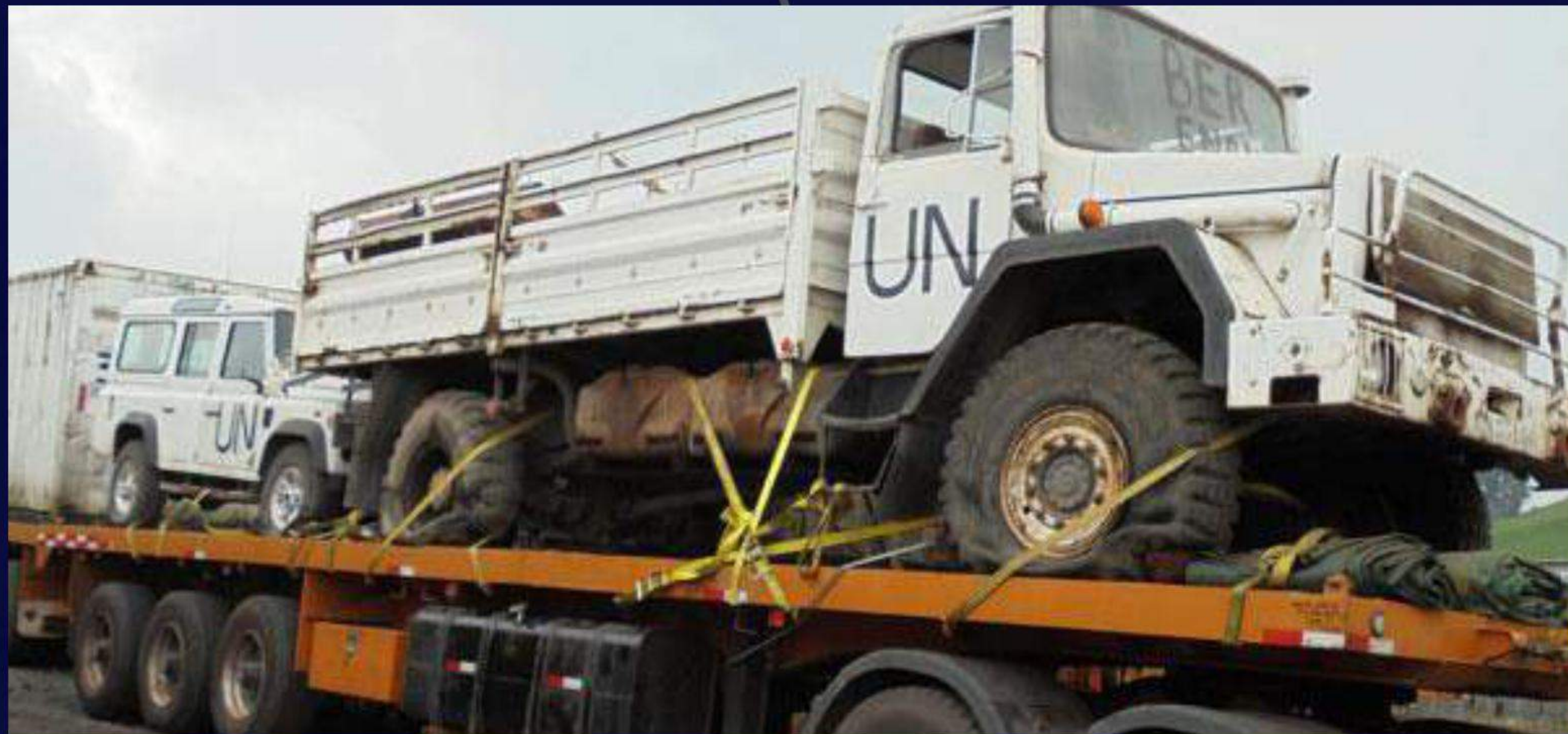
▶ UNITED NATIONS MILITARY MOVEMENT - DRC ◀