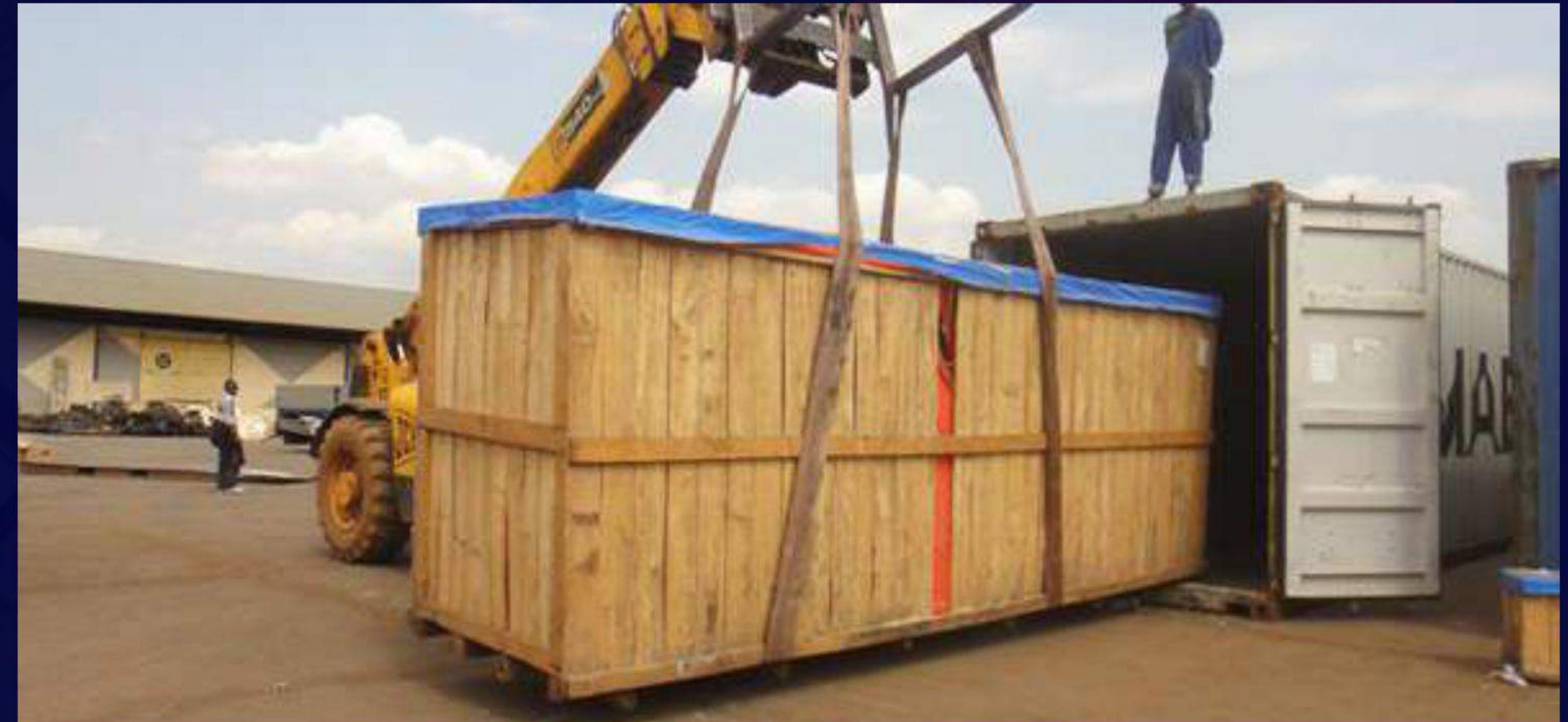
▶ CRUSHING PLANT FROM CHINA TO KIGALI ◀