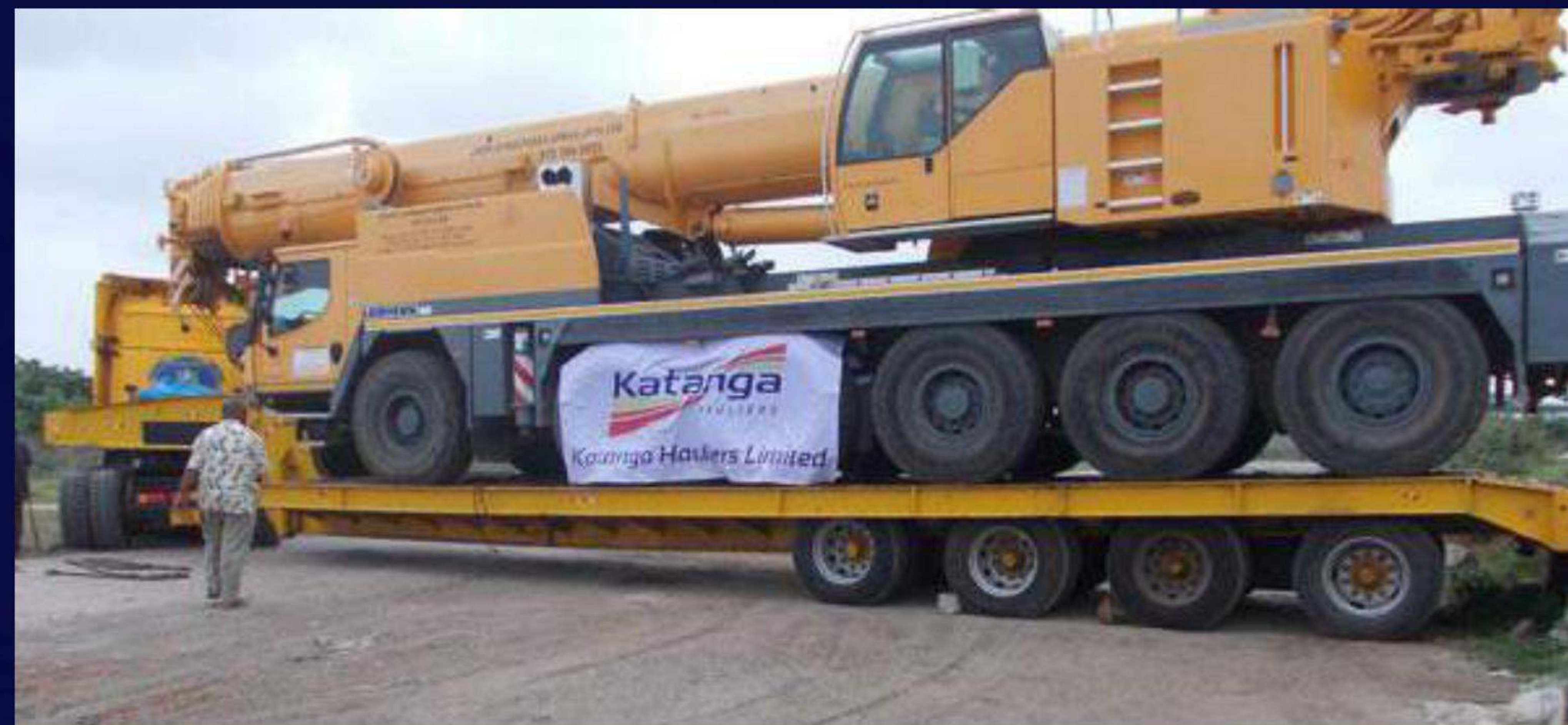
▶ JYOTHI STRUCTURE - 50 TON CRANE DELIVERY FROM DAR TO DODOMA ◀