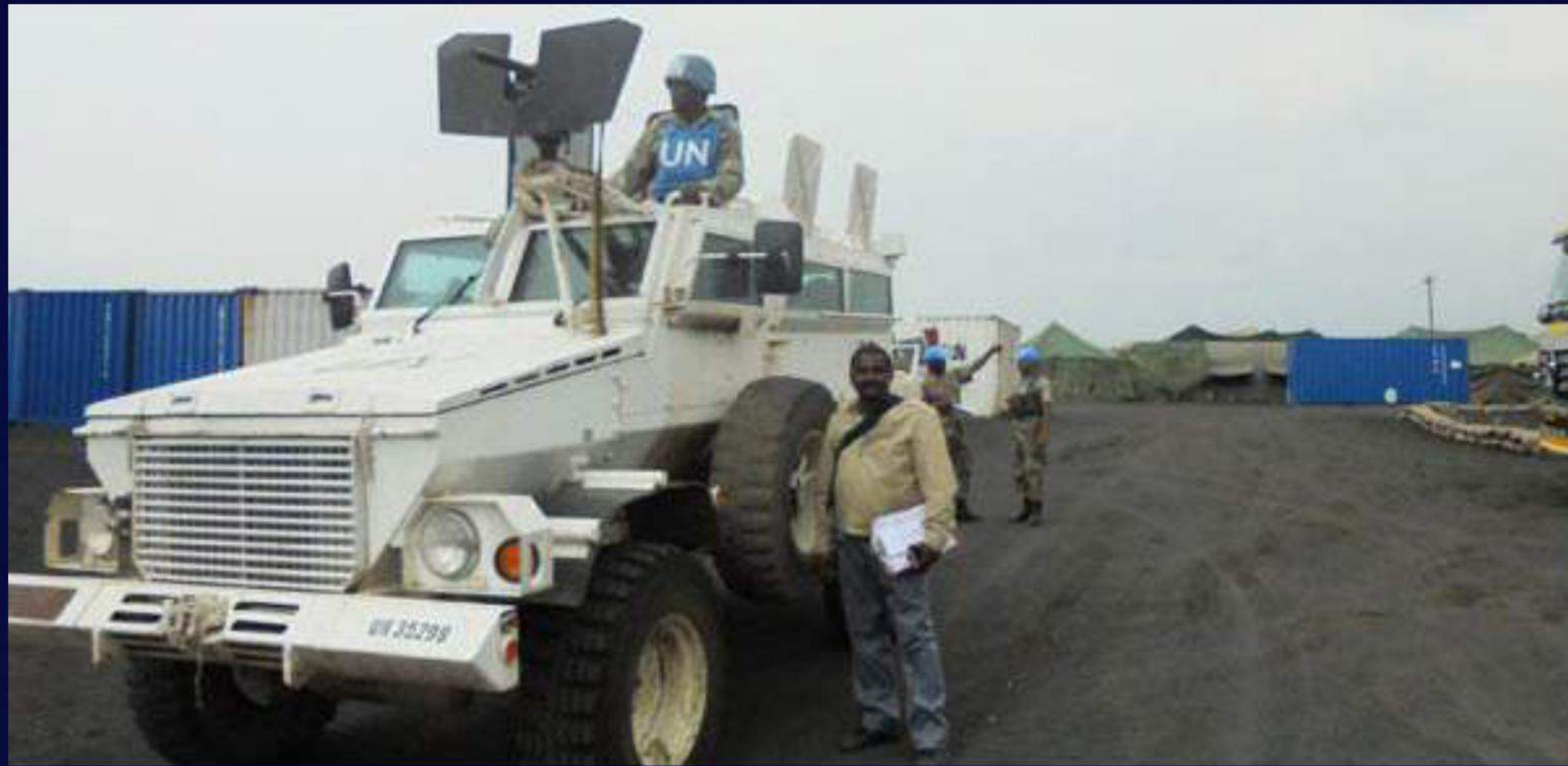
▶ UNITED NATIONS MILITARY MOVEMENT - DRC ◀