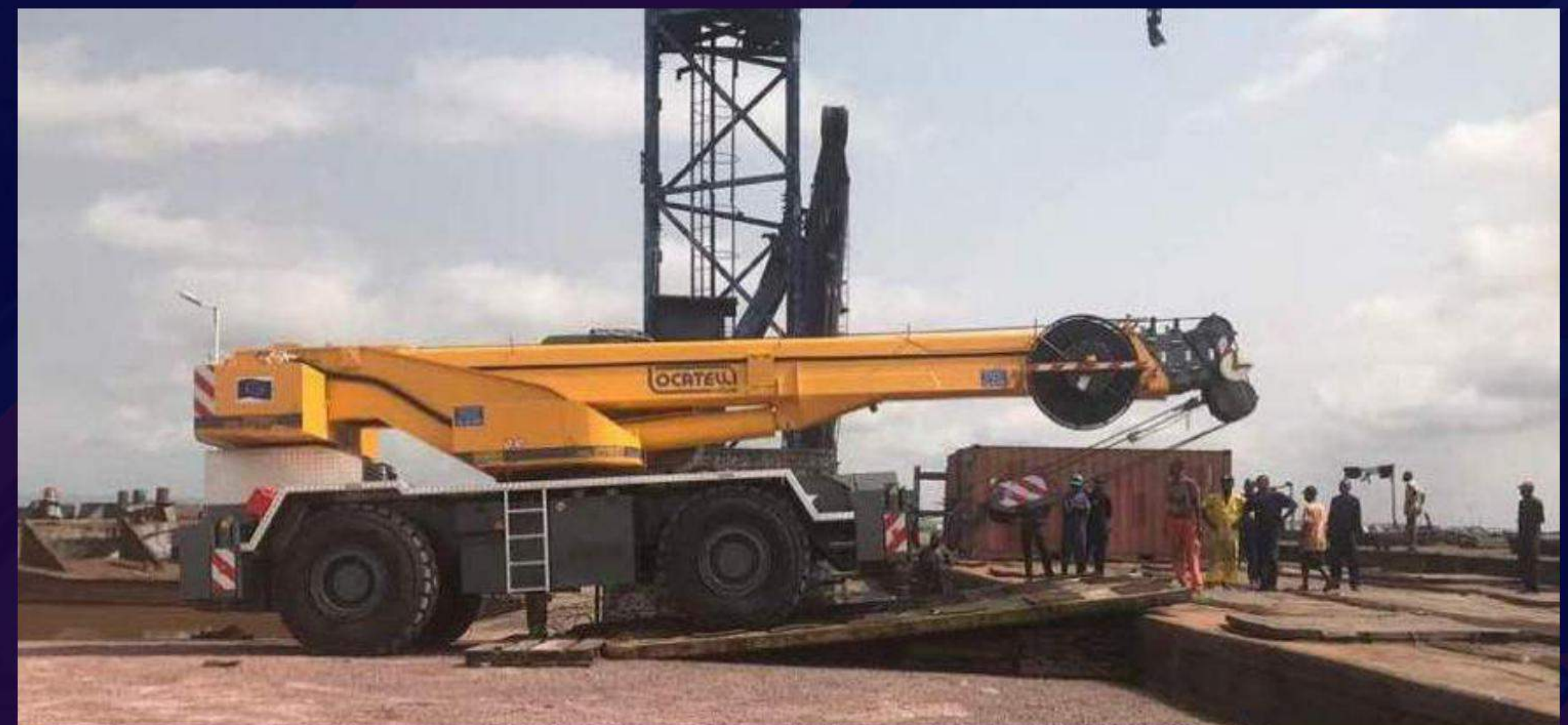
▶ TRANSPORTATION OF 50 TON CRANE THROUGH BARGE IN DR CONGO ◀