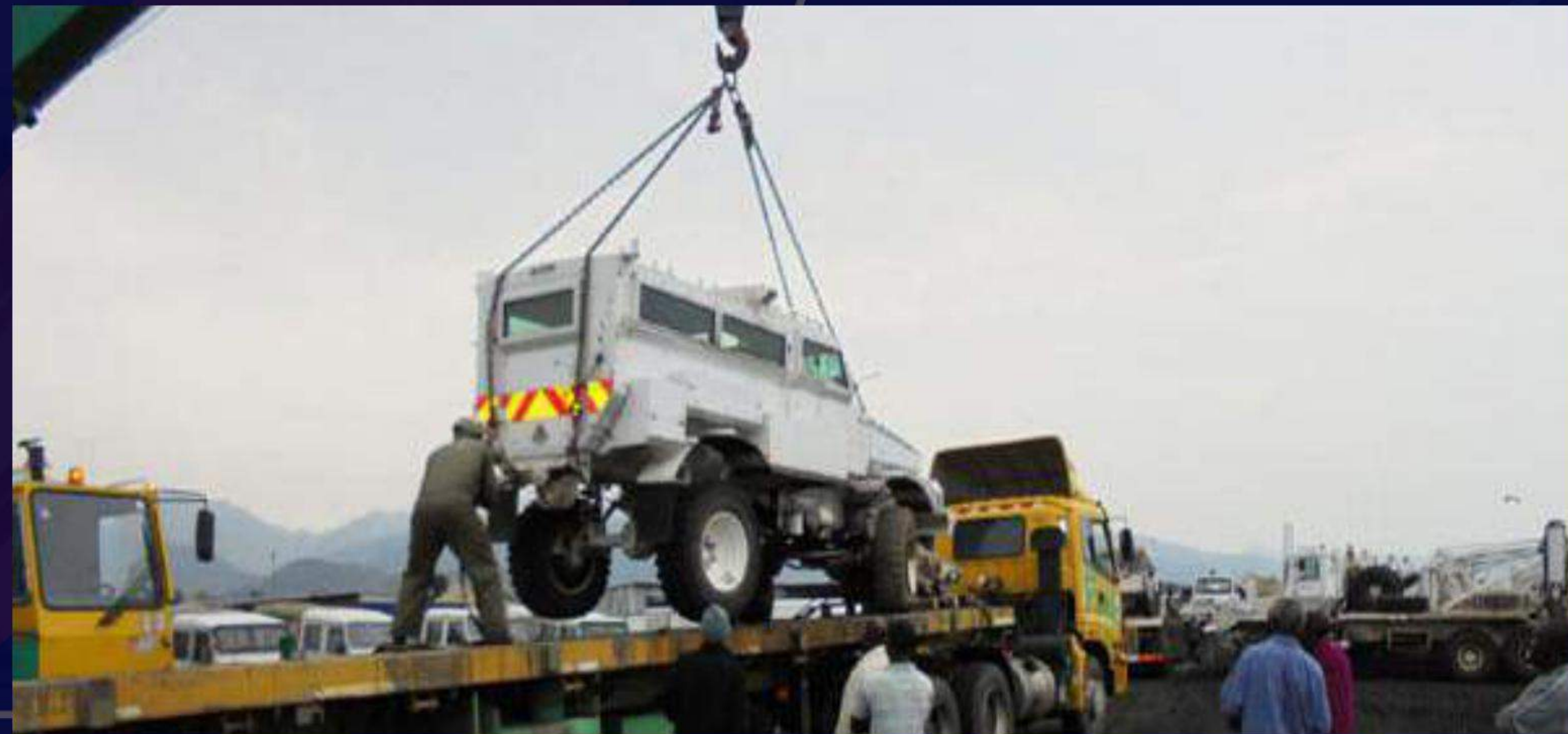
▶ UNITED NATIONS MILITARY MOVEMENT - DRC ◀