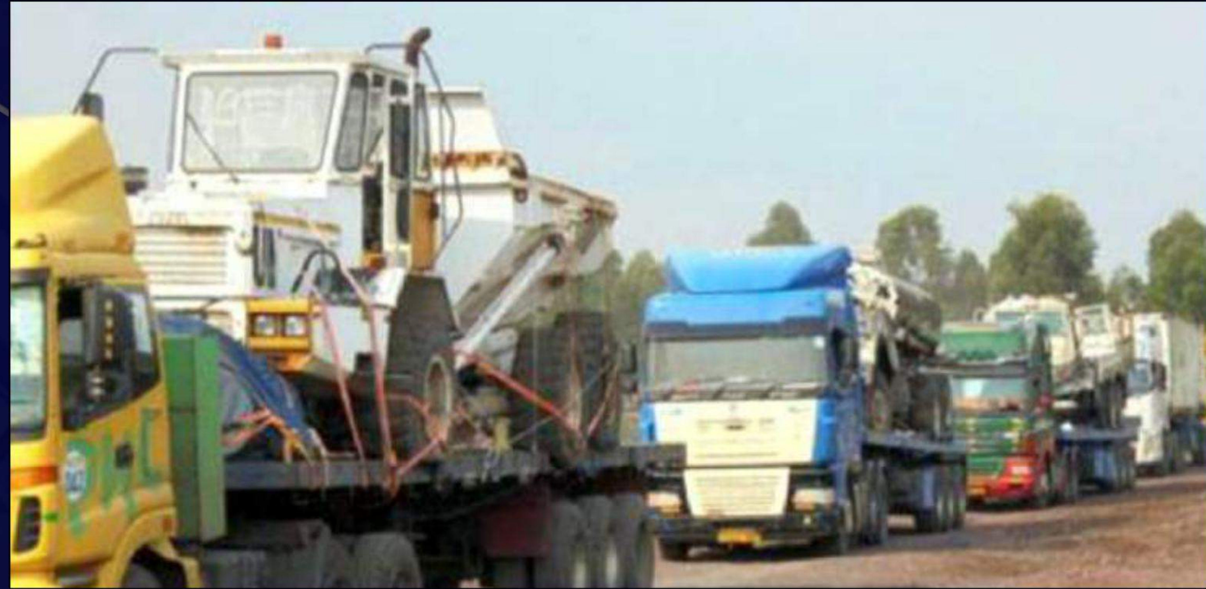
▶ UNITED NATIONS MILITARY MOVEMENT - DRC ◀